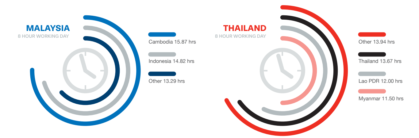
Figure 3: Average working hours by nationality, by country of destination