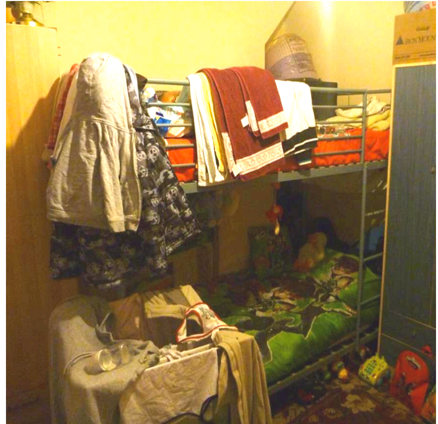
Overcrowded HMO, Southwark