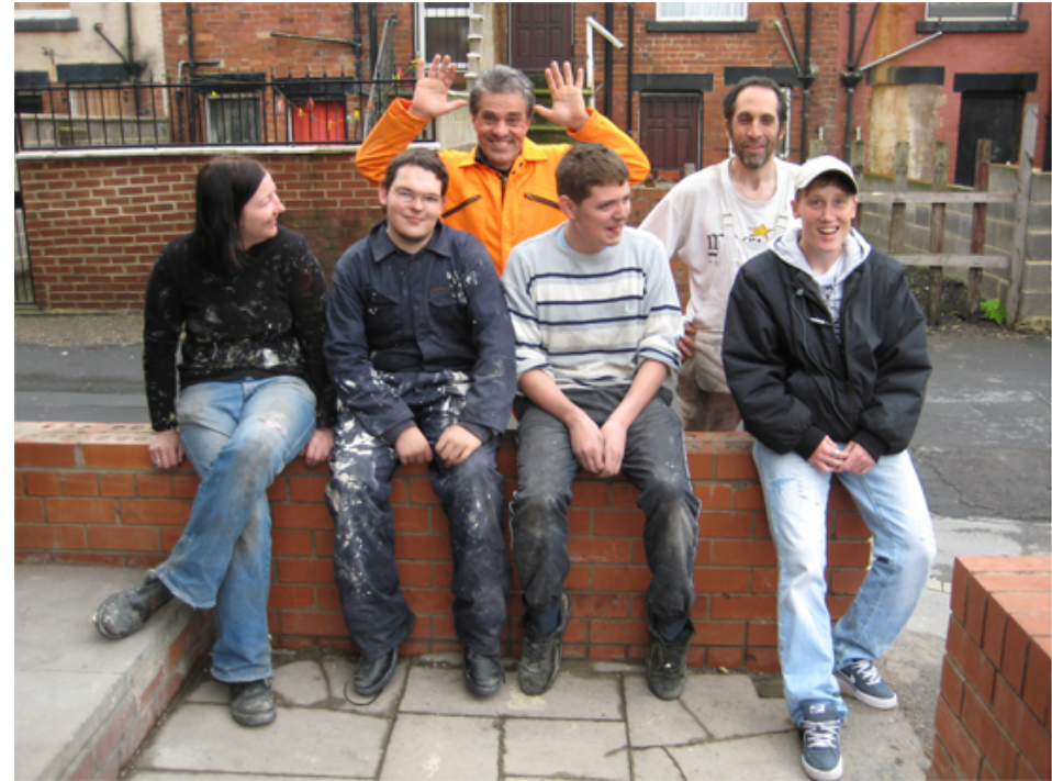
Canopy project Leeds