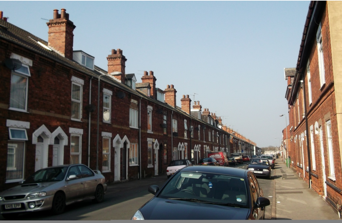
Recently converted terraces, Goole