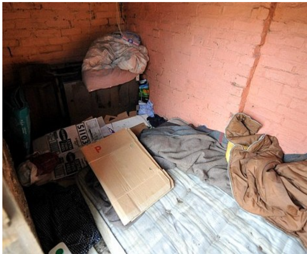
‘Bed in shed’ Slough