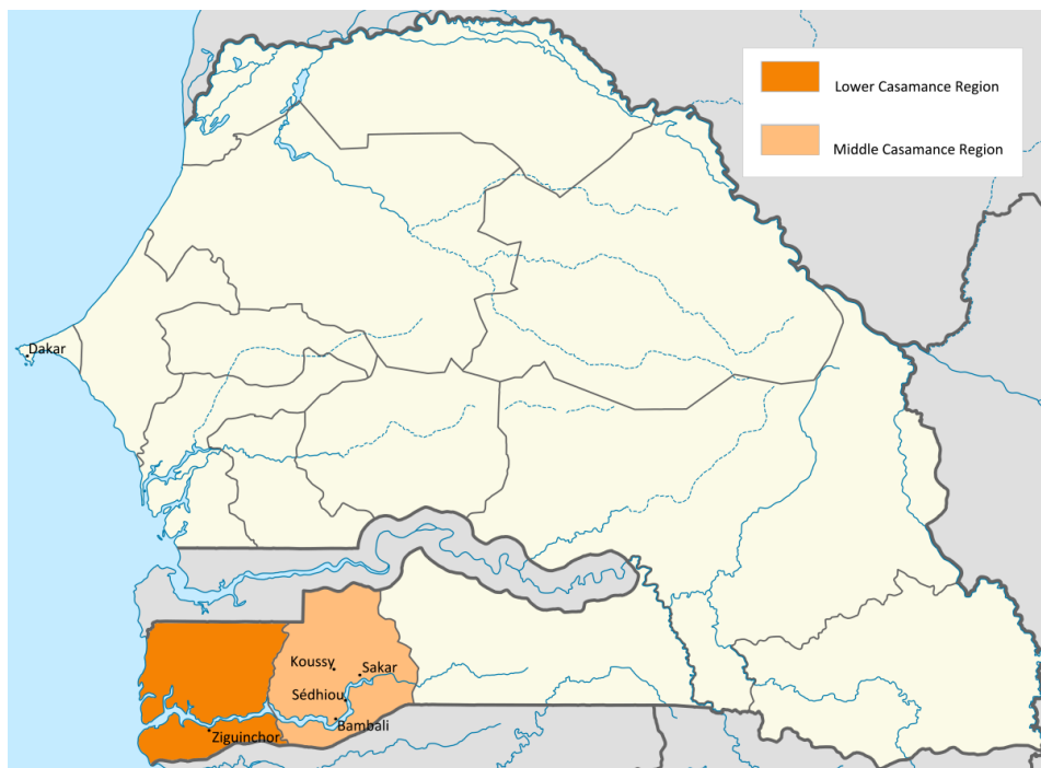
Map 2 Field sites in Casamance

By the time the international migration this paper deals with commenced, Casamance had become internally very diverse across a number of different categories. Culturally, a large number of different ethnic groups coexist (cf. Table 2, page 20) and most speak more than just their mother tongue and official language. While the Jola ethnicity forms the majority in the lower Casamance, the middle Casamance is generally understood to be mainly inhabited by Mandinka. Yet, there are many people who ascribe to the Balant, Fula, Mancagne, Manjak, and Wolof ethnicities. Religiously, Casamance is also the region of Senegal that is the most heterogeneous (see Figure 2, page 21). As the figure explicates, all departments of the lower and middle Casamance have a share of between 7 to over 30 per cent of Christians and shares of adherents of traditional religions of up to 35 per cent (Ansd s.a.).