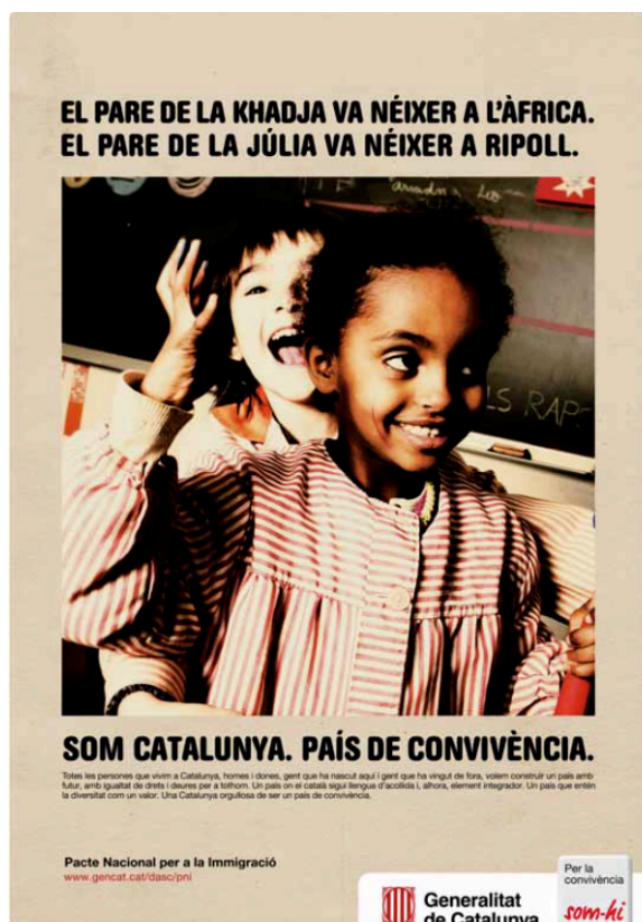
Figure 1: We are Catalonia. Country of conviviality.

'Som Catalunya. País de convivència' – in 2009, I was welcomed back to my field site by three posters portraying two people each, of different ages and different ethnic backgrounds. The headlines stated the different countries of birth of either the parents or grandparents of the individuals depicted. Under the main slogan 'We are Catalonia. Country of convivència ', it said that natives and people who had moved there aimed to construct together a country with a common future, and with equality of rights and duties for all. Catalan was meant to be an integrative element as the language of reception. And finally, the poster stated that in Catalonia diversity was an asset, and that Catalonia was proud to be a country of convivència . 16 Despite the many alternative terminologies and more detailed goals of the